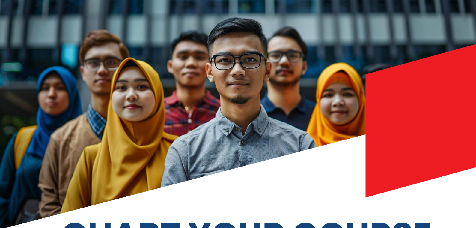
CHART YOUR COURSE WITH MUST'S UNDERGRADUATE PROGRAMS